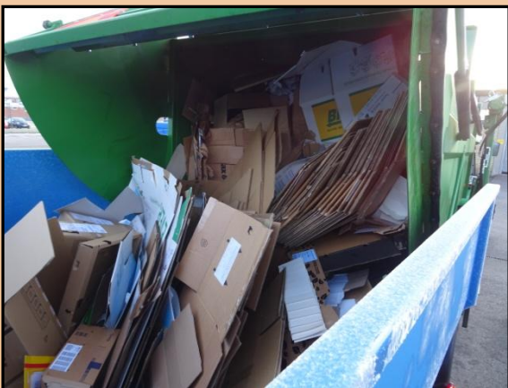
Unloading of cardboard.