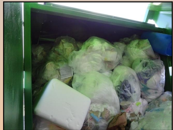
Unloading of waste.