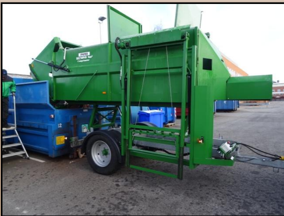
Unloading height as desired.