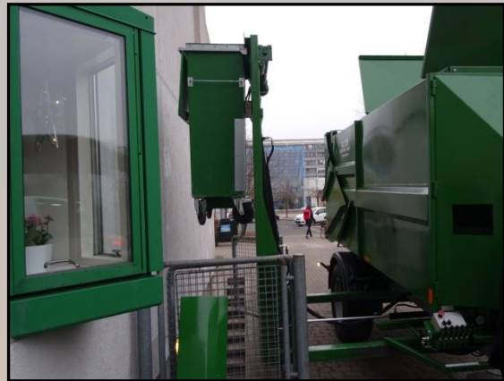
Offsetting of lift 100cm