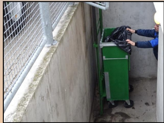
Lift long, from cellar shaft.