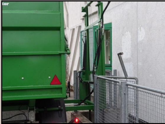
Offsetting of lift 100 cm