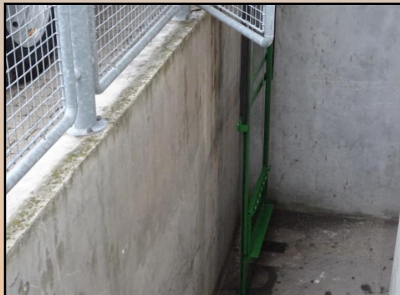
Lift long, from cellar shaft.